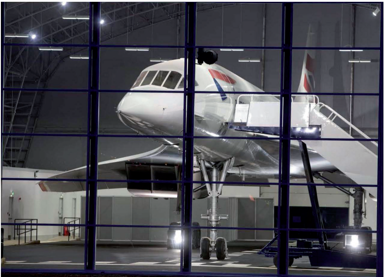
Viewing and exhibition facility for Alpha Foxtrot

The Save Concorde Group (SCG) presents “Concorde for Filton” – a plan to provide a high-quality yet cost-effective home for Concorde G-BOAF (Alpha Foxtrot) at Filton. We propose to put Alpha Foxtrot centre-stage in a showcase of Bristol’s aviation heritage, as well as to provide first-class educational and conference facilities.